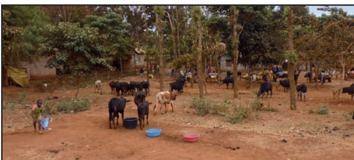
In central Tanzania, cows are parked, waiting for their owners to return with refilled water containers, before hauling them back to their villages.

How to make more of our aid successful ? The 27 national EU governments should start to liaise with each other (incredibly, they do not liaise at present) in order to reduce duplication and lack of coordination. In Africa we do not have enough people on the ground to see where the money goes because Europe finances so many different projects. Bill Gates (ex Microsoft) described to our committee how, when he donates aid for a medical project, he sends someone along to check whether the money is being well spent and, if it is not, he cancels the payment.