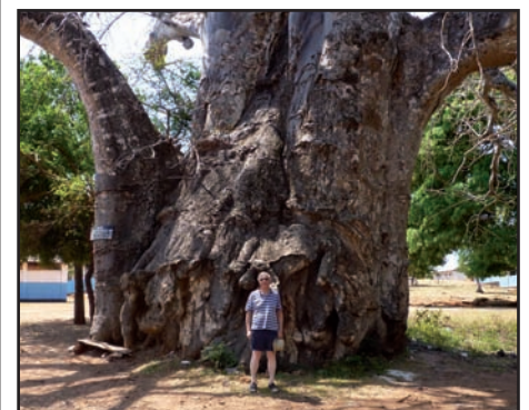
A Baobab tree, more than a thousand years old, which I photographed on holiday in a village by the ocean in south Zanzibar.

The euro-sceptic Conservative right-wing is incoherent and illogical. They want to "protect the integrity of the Single Market" while also wanting "to repatriate powers" without saying which ones. You cannot do both.