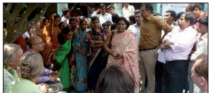
Visiting a village in Bihar, the poorest state in India, where the poorest women are helped not to marry off their daughters at thirteen years old